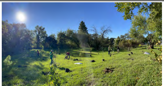
Large-Scale Tree Planting on TUBs Location #1

events, such as Hurricane Harvey and other frequent repetitive flood events that impact rivers and waterways both upstream and downstream in respective regional counties, compounded by tropical storms originating in the Gulf of Mexico, sparked substantial increases in buying out FEMA-qualified properties to reduce flood risk but more needed to be done to improve these properties - mainly in high-health risk and EJ communities.